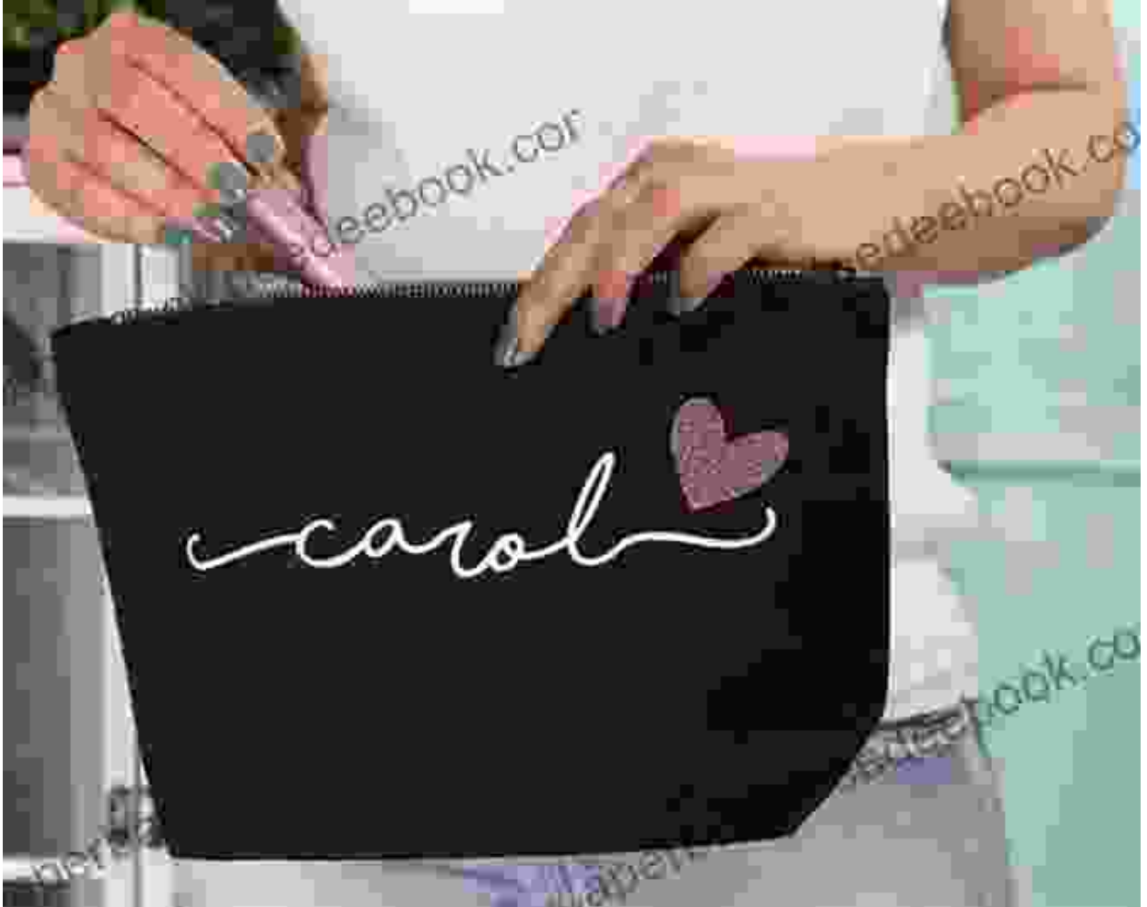
4. Personalized Makeup Bag with Name