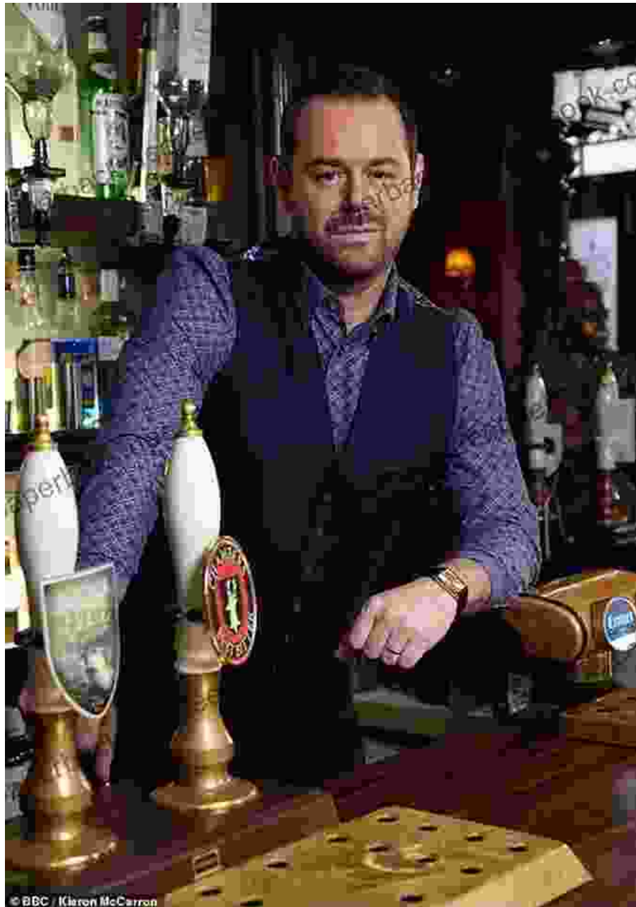
Danny Dyer as Mick Carter