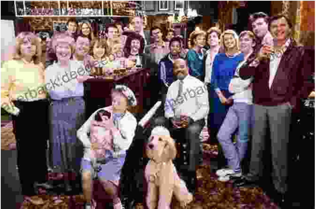
The EastEnders cast

remain one of the most popular and enduring soaps on television.