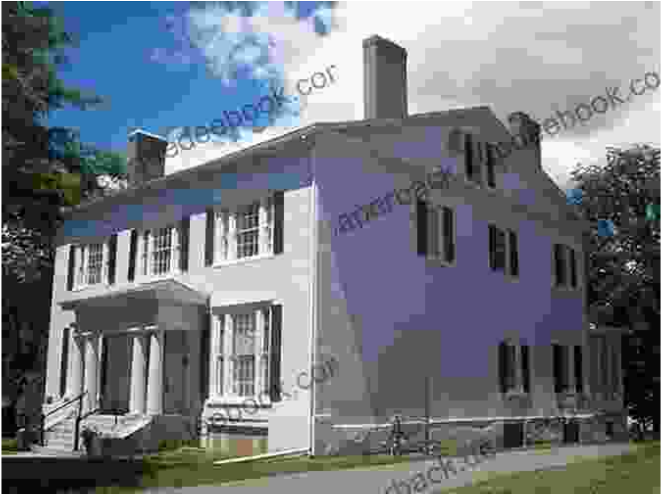
Le Roy House and Museum