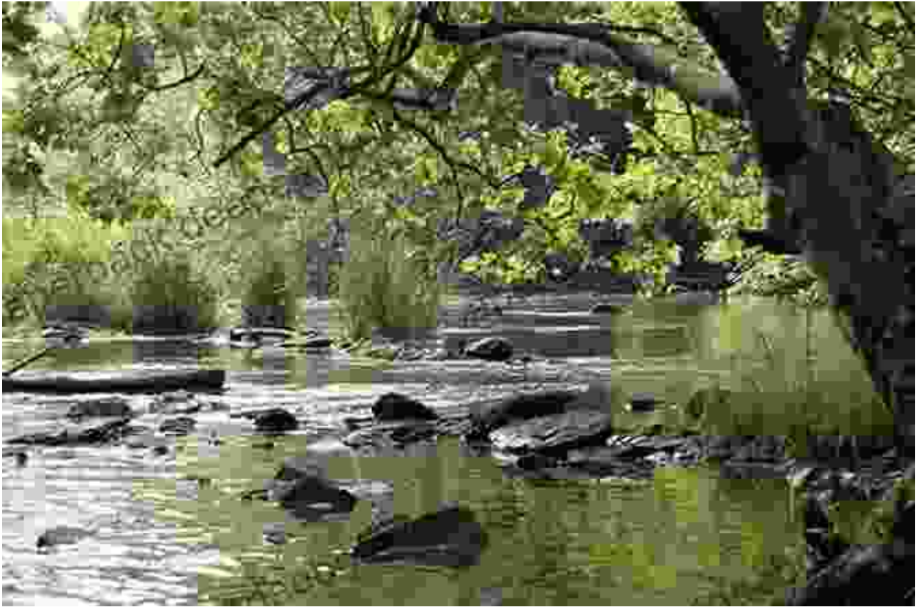
Oatka Creek Park