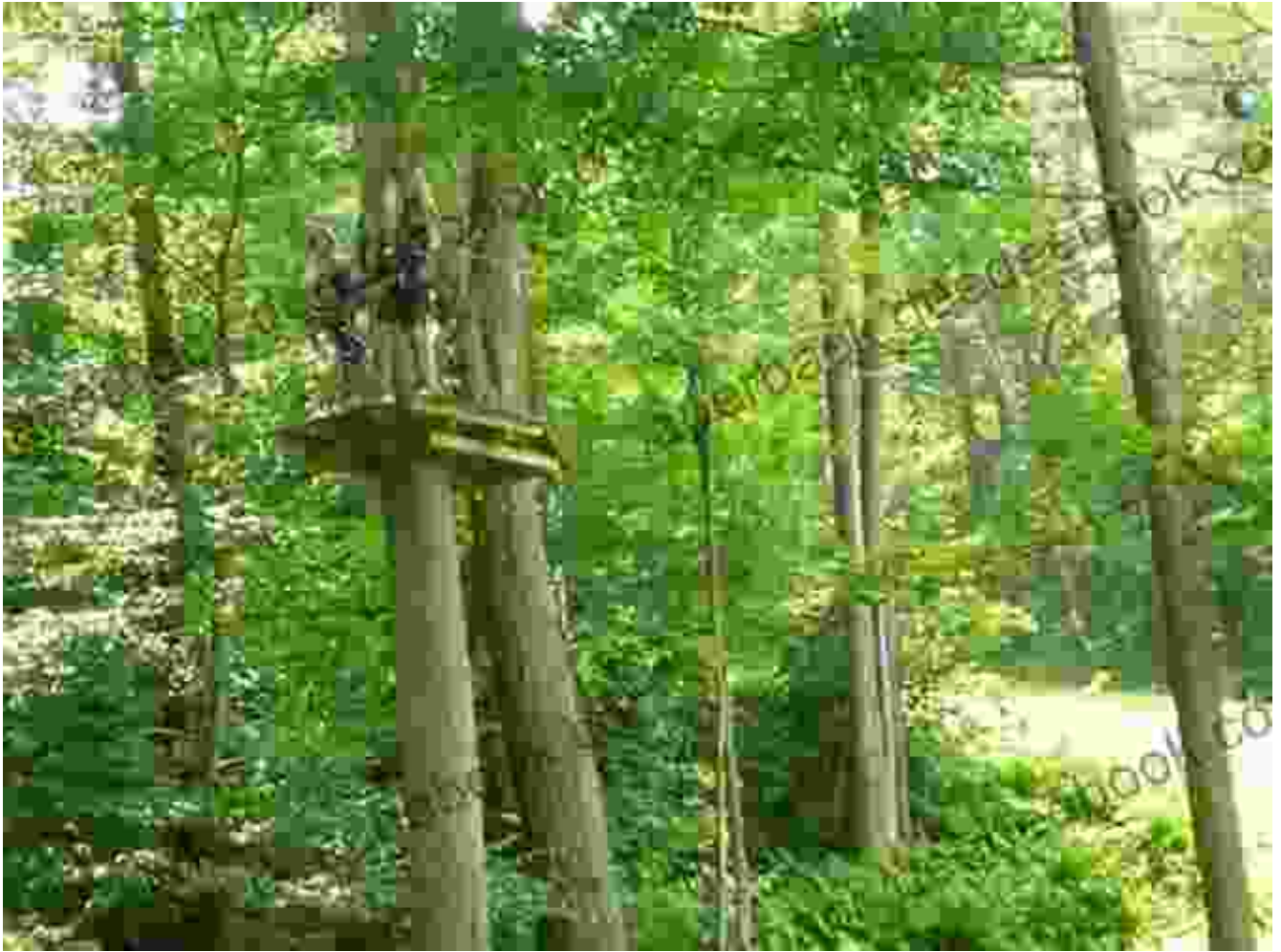
Sky High Aerial Adventure Park