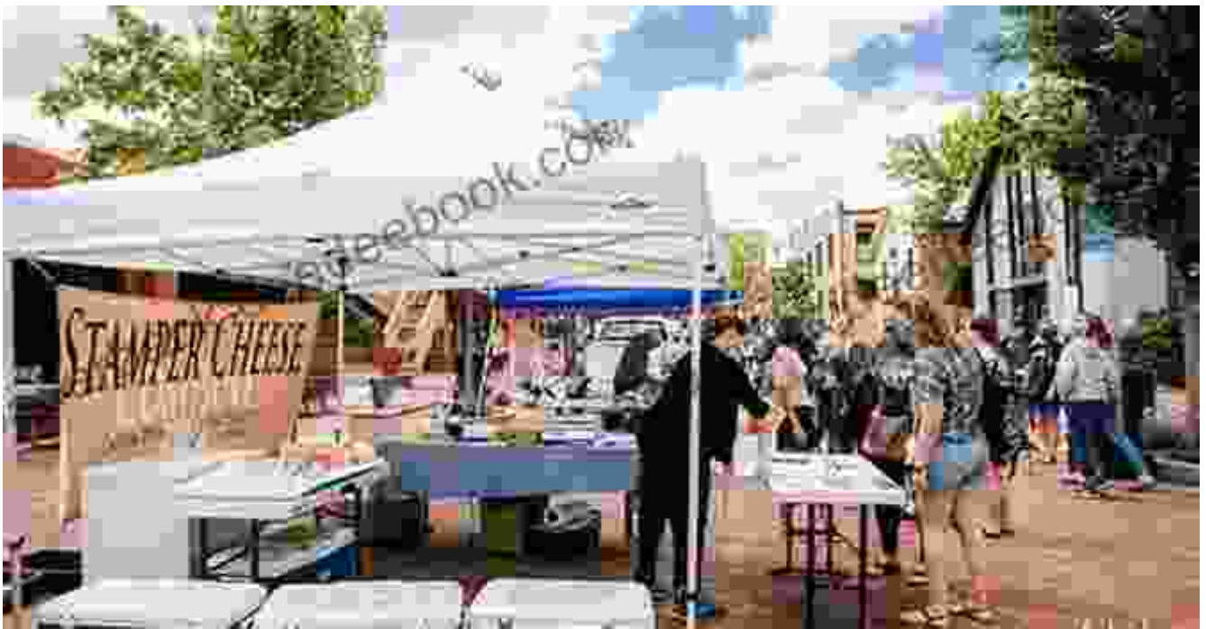
Batavia Farmers' Market