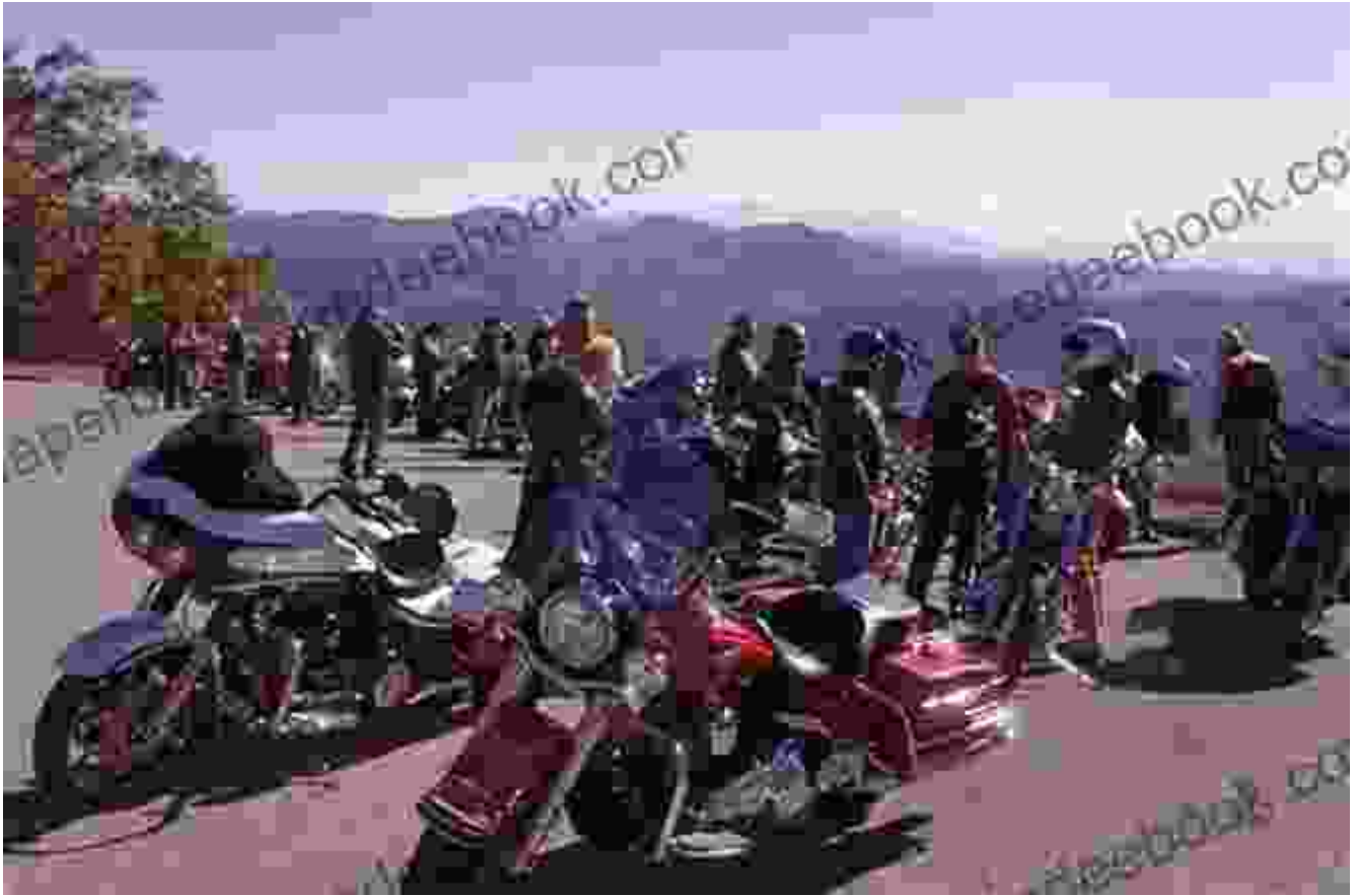
A group of motorcycle riders riding through a small town