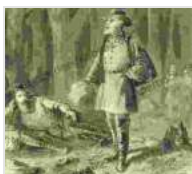
Robert E. Lee by Jefferson Davis