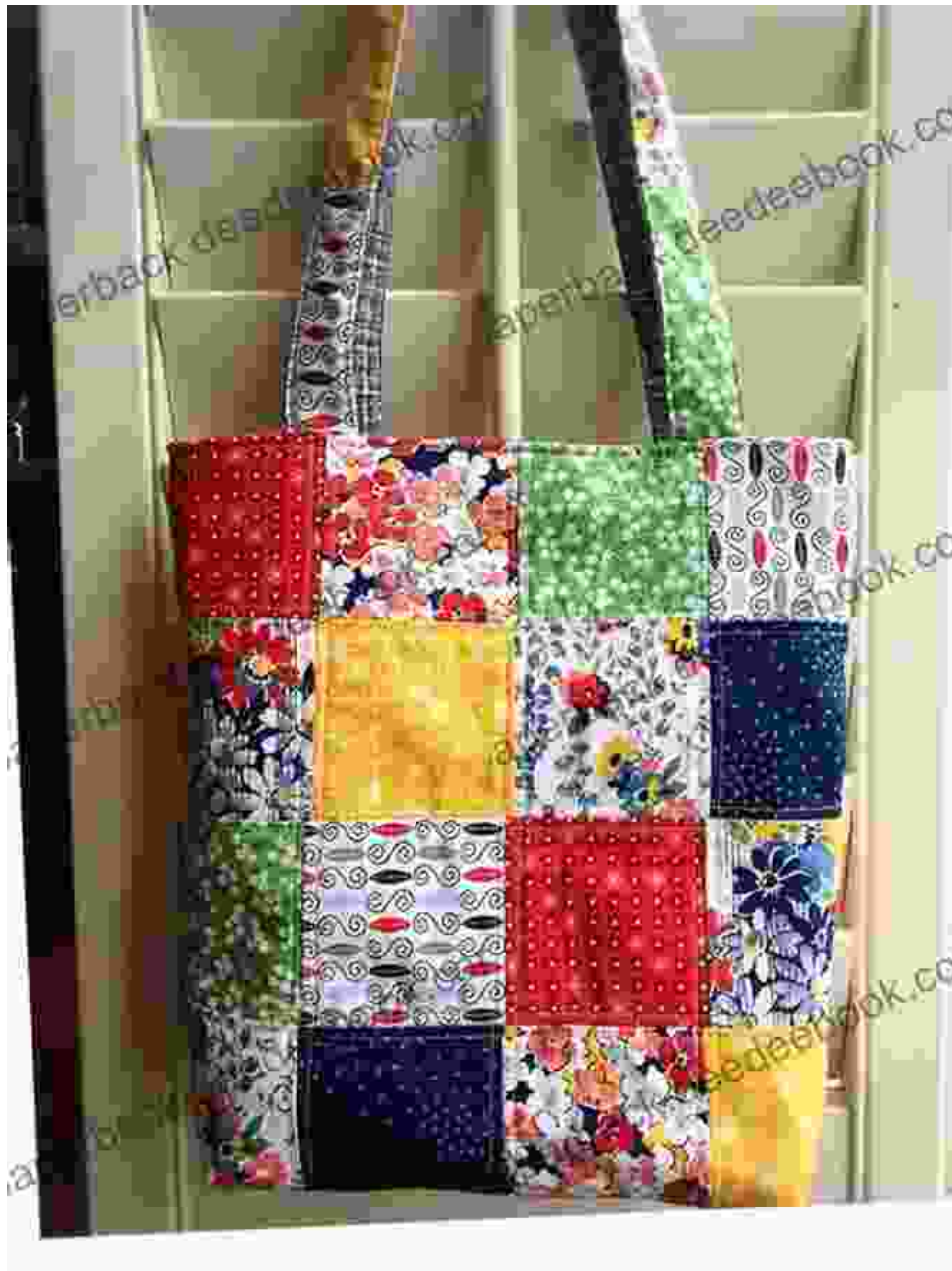
Patchwork Tote with Leather Accents