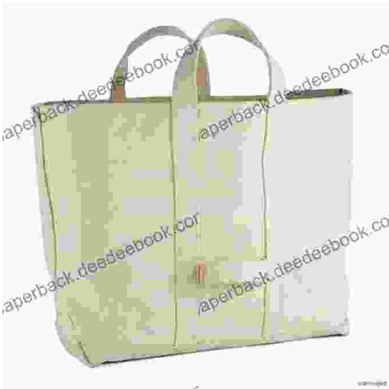
Basic Tote Bag

Carry your everyday essentials in this spacious and durable tote bag. You'll learn how to sew strong and even seams to ensure your bag stands up to regular use.