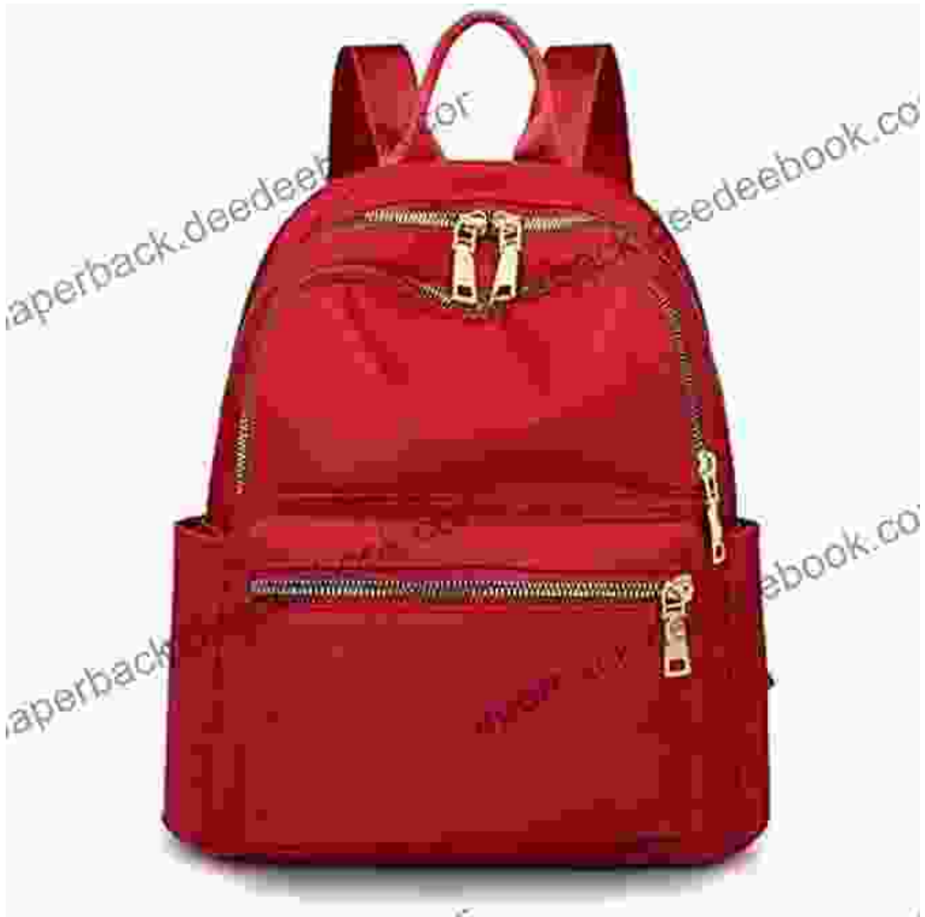
Backpack with Zippered Pocket