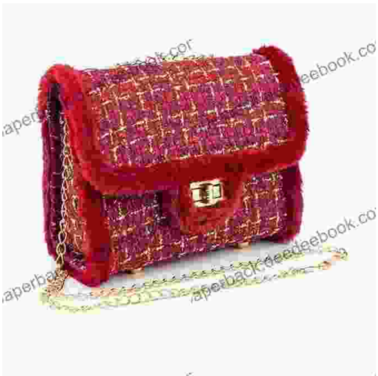
Faux Fur Clutch with Tassels